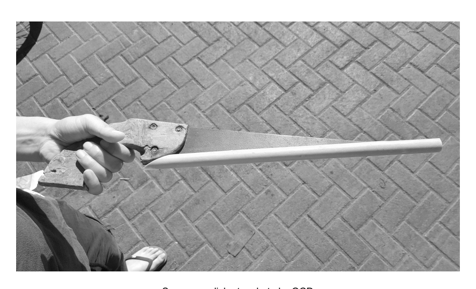
Saw cover diskarte