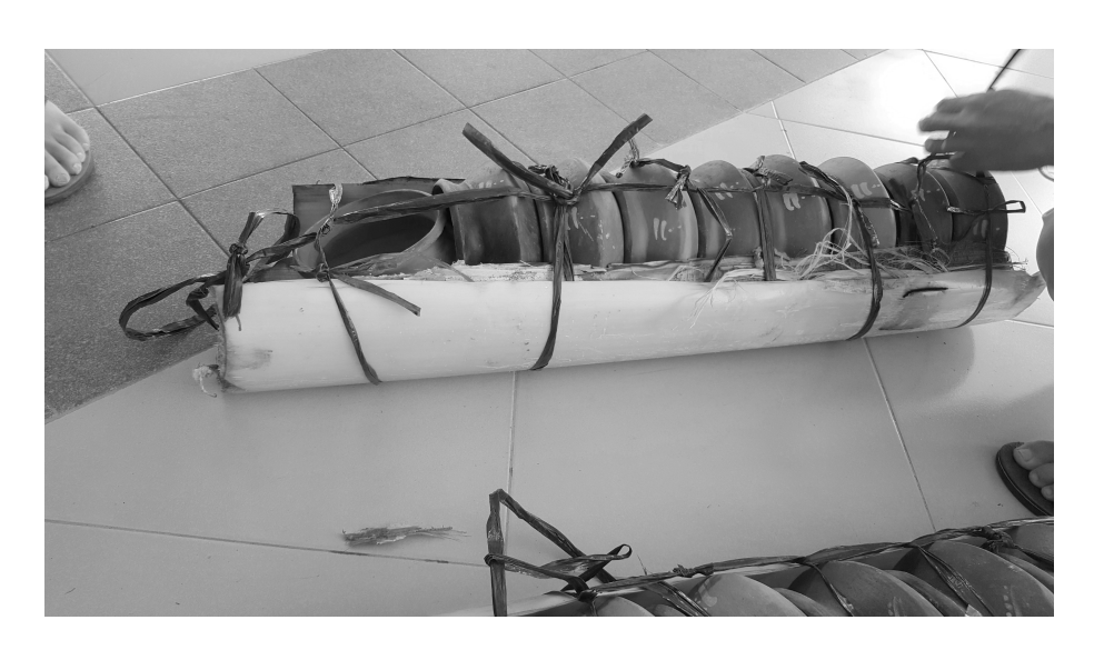
Local market supplier banana trunk and plastic tie diskarte