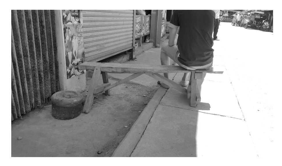
Pilay [disabled] bench diskarte