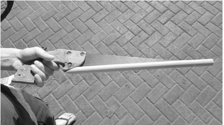
Saw cover diskarte