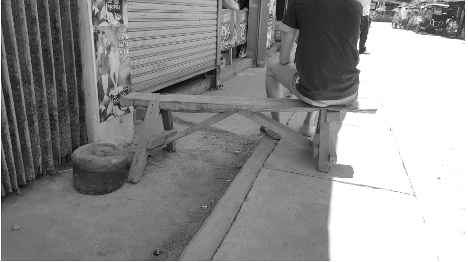
Pilay [disabled] bench diskarte